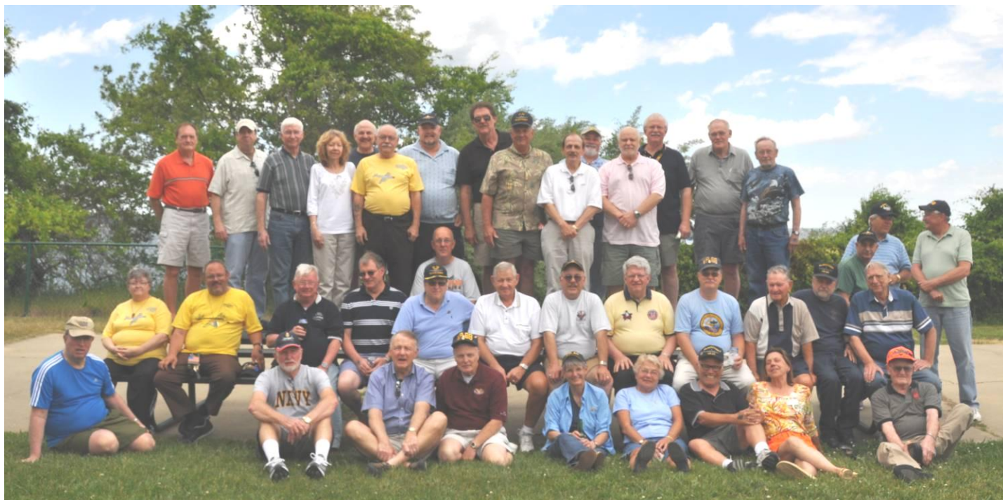
2010 Spring Fling – NAS PAX River

The Hawk's Nest is the official newsletter of the VP-68 Alumni Association, chartered in 1998 in the state of Maryland for the sole purpose of uniting in a central organization all former "Blackhawks" of Navy Patrol Squadron 68 (VP-68), its parent and supporting Navy squadrons, and those interested in preserving the name and history of VP-68.