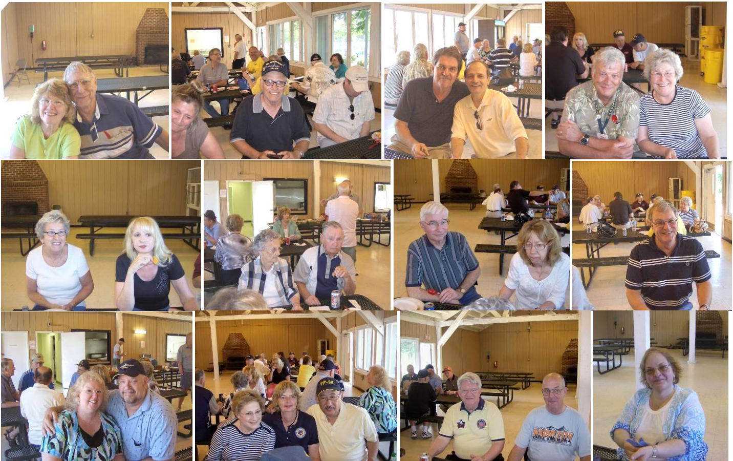
2010 Spring Fling photos courtesy of "Doc" Durity and Dick & Jo Ann Fickling