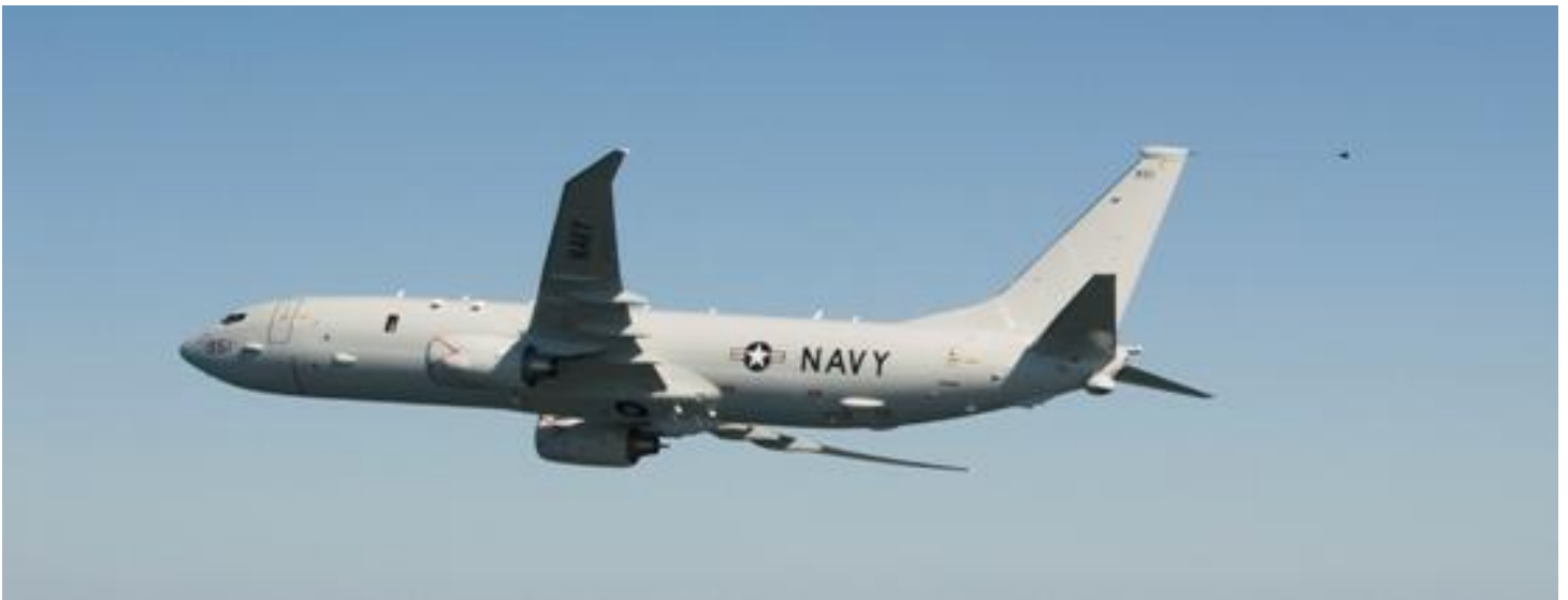
P-8A Poseidon (T-1) arrives at NAS PAX River (see page 2)

The Hawk's Nest is the official newsletter of the VP-68 Alumni Association, chartered in 1998 in the state of Maryland for the sole purpose of uniting in a central organization all former "Blackhawks" of Navy Patrol Squadron 68 (VP-68), it's parent and supporting Navy squadrons, and those interested in preserving the name and history of VP-68.